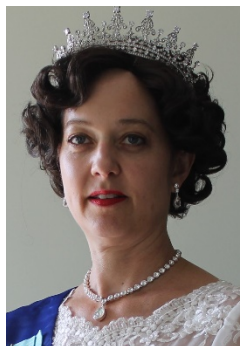
Queen Elizabeth II